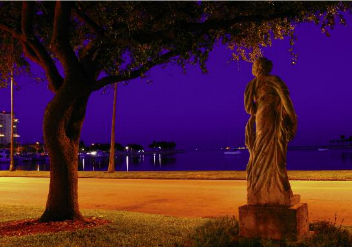
This pre-dawn photograph of St. Petersburg's Vinoy Park is filled with dreamy, poetic light.