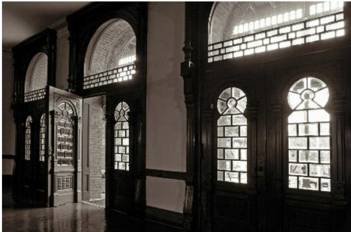
The University of Tampa is perhaps one of Tampa Bay's most photographed landmarks, but it is difficult to tell if this image was taken